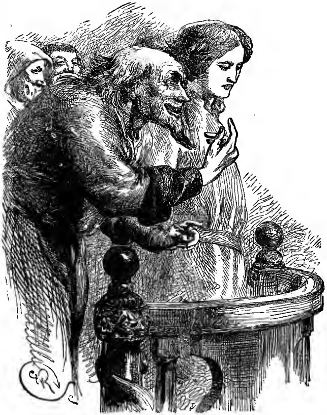
Pickthank's Testimony against Faithful.